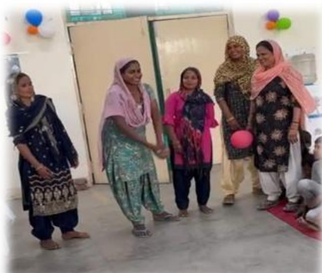
Parent Interaction & Activities