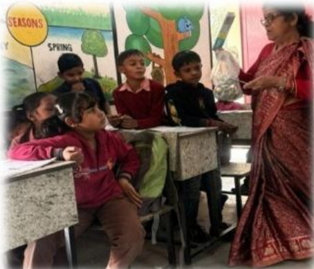
Chuharpur Khadar Primary School