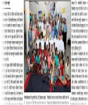
शारदा कौशल विकास केंद्र में कंप्यूटर साक्षरता का शुभारंभ