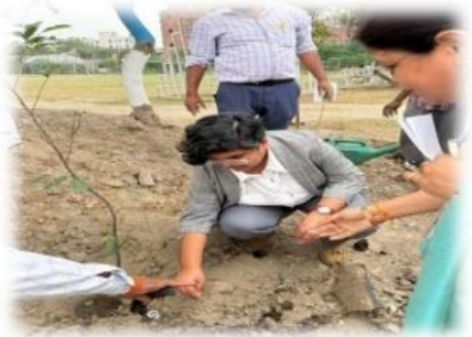
Ms Bijeta Mohanty Ministry of Textiles, Government of India