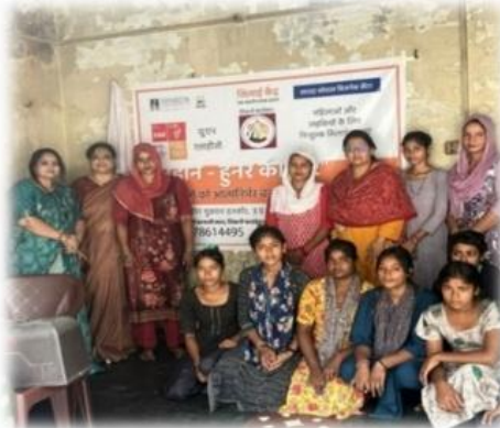
Village Dairin Gujran