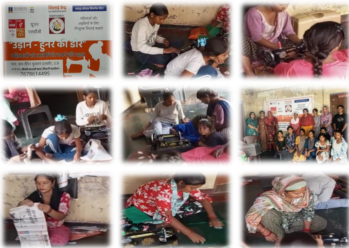
Sewing classes at Dhankaur village

Sewing classes were initiated near Dhankaur village, where 25 girls have been trained in tailoring skills. This initiative has helped enhance their confidence, employability, and opportunities for income generation.