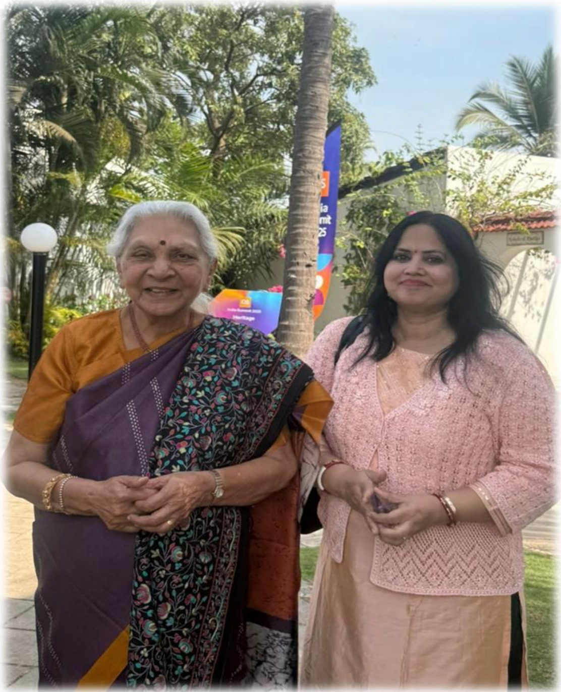
Governor of Uttar Pradesh (UP) Smt. Anandiben Mafatbhai Patel